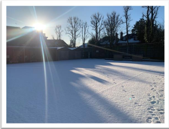
Snow art by CWC

Whilst not all of our Hendon Prep children got to enjoy the snow covered playground, both our critical worker club children, and of course our Preschool children, who are in school made the most of the beautiful snow covered space.